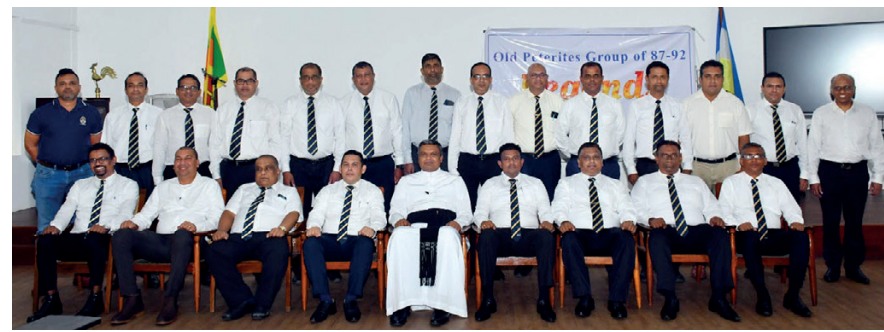
The office bearers for the group of 87-92 are as follows,